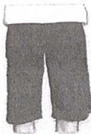
Plain Twill Walking Shorts