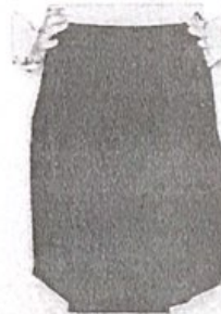
Skort (Combined short and skirt)

Please Note: The above are the minimum items that were approved originally as a system standard and continue to be supported. Your support in compliance to the above is very much appreciated.