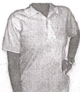
Golf Shirt Regular Sleeve 2-3 Buttons (no capped sleeves)