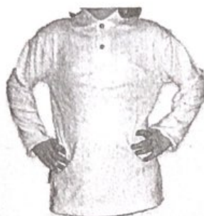
Polo Shirt 2-3 Buttons